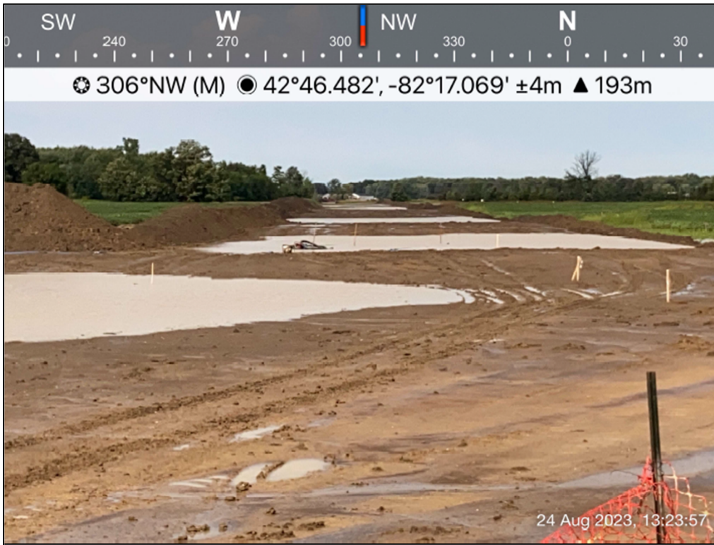
2. Wet soils shutdown following striping of topsoil.