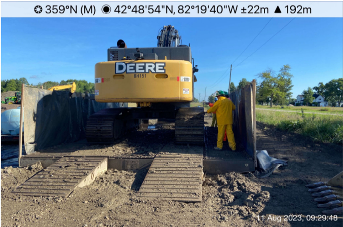
5. SCN wash station used to clean equipment moving between SCN positive and SCN negative fields during topsoil handling.