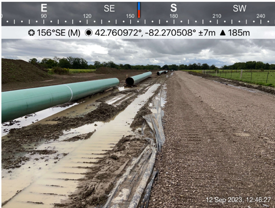
4. Gravel ramp installed in low area to mitigate compaction during we soils conditions.