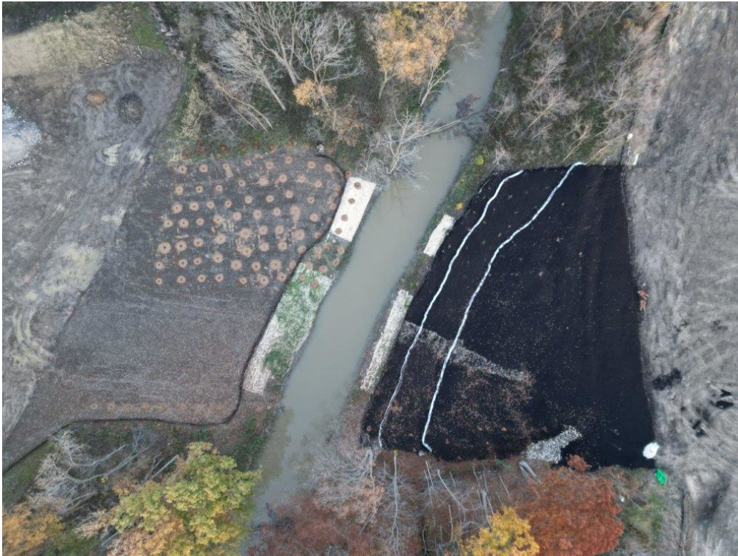
8. Aerial view of Black Creek restoration.