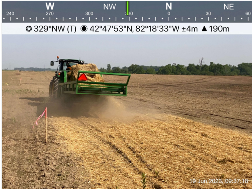
1. Straw being spread for stripped topsoil piles .