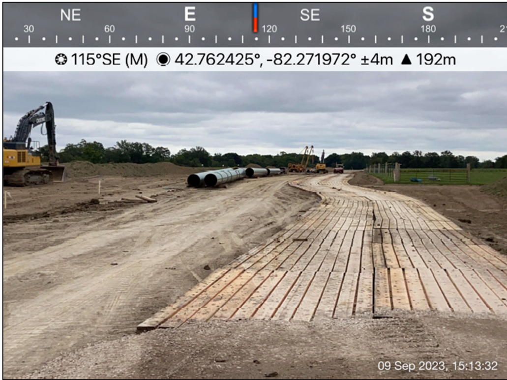
3. Rig mats placed to mitigate compaction due to wet soils and permit all weather access.