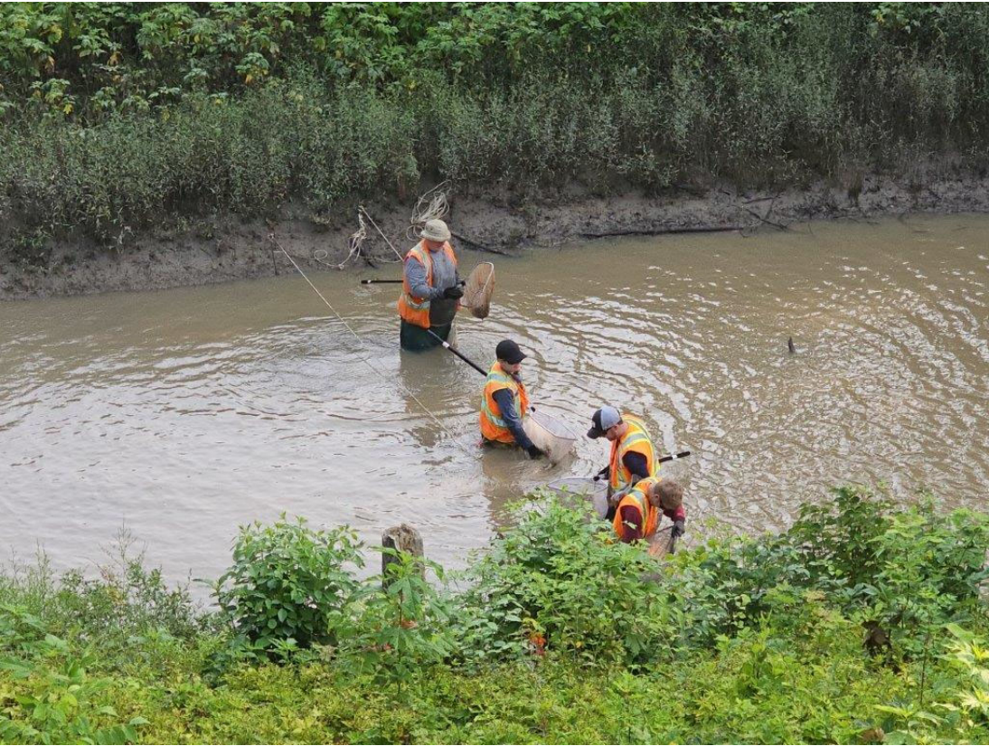
6. Mussel relocation program at the Black Creek watercourse crossing.