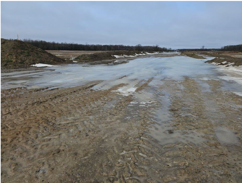
10. Easement and TLU condition January 2024 prior to restoration and clean-up in spring/summer 2024.