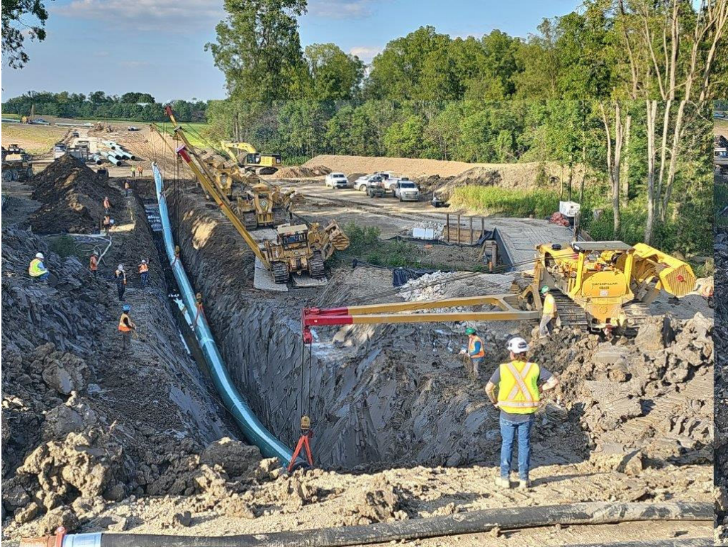
7. Pipe installation at Black Creek using the isolated Dam and Pump Crossing method.