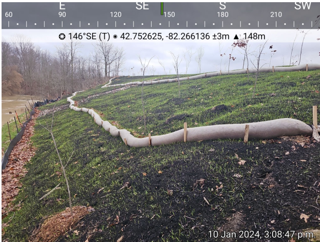
9. Seed germination on the south bank of the Black Creek restoration prior to winter.