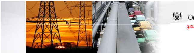
Toronto Hydro-Electric System Limited - EB-2011-0144

lease complete the following continuity schedule for your Group 1 Deferral / Variance Accounts, Account 1521 and further instructions.