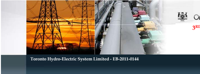
Toronto Hydro-Electric System Limited - EB-2011-0144

Please complete the following continuity schedule for your Group 1 Deferral / Variance Accounts, Account 1521 and 1562 and follow further instructions.